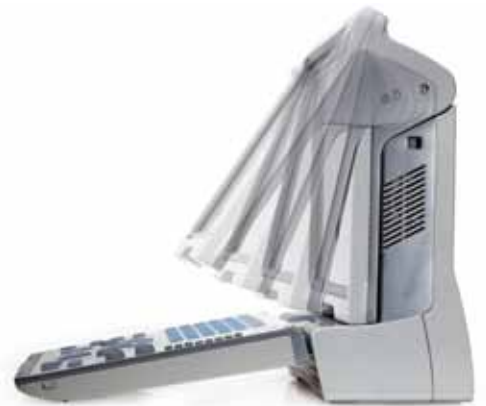
Tilting LCD display allows easy viewing